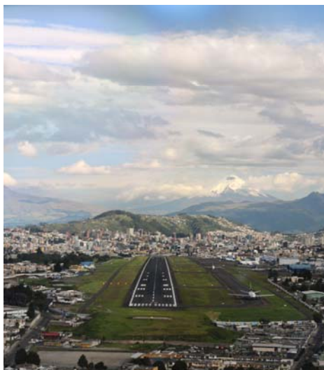
Approach to runway 17 Quito Airport Cotopaxi volcano on the background