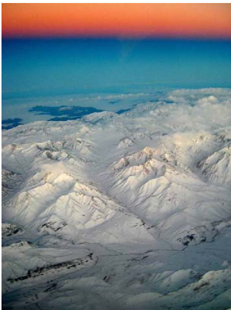
At dawn in the Andes

http://en.keilir.net/keilir/about_keilir/gallery/conference_on_eyjafjallajokull_and_aviation